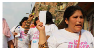
CENCA - Urban Development Institute (Peru)

Agroecology, health, education, self-improvement in rural communities