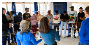
Frères des Hommes (France)

Defence of marginalised communities (low castes, women, workers and unions)