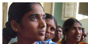
Fedina - Foundation for Educational Innovations in Asia (India)

Agroecology, nutrition, rural development