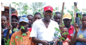
MPP - Movement Farmer Papaya (Haïti)

Popular education, international solidarity, citizen engagement