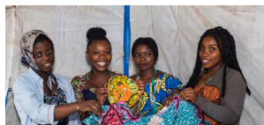
APEF - Association for the Promotion of Women's Entrepreneurship (DRC)

Promotion of human rights, economic empowerment, food security, agroecology