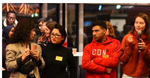
Batik International (France)

Promotion of human rights, economic empowerment, food security, agroecology