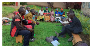
Adenya - Association for the Development of Nyabimata (Rwanda)

Empowerment, access to rights, socio-economic integration