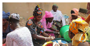
UGPM - Union of Peasant Groups of Meckhé (Senegal)

Support of the rights and interests of farmers, fight for climate justice